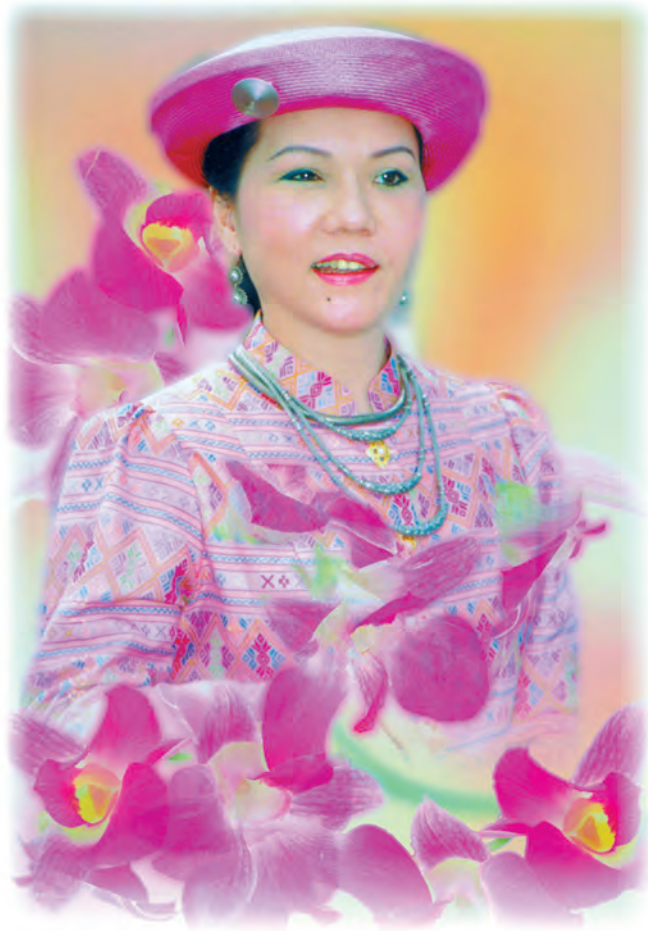
THE SUPREME MASTER CHING HAI