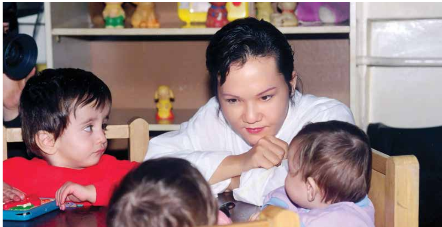
SUPREME MASTER CHING HAI SPENDS TIME WITH CHILDREN AT AN ORPHANAGE – YEREVAN, ARMENIA (MAY 15, 1999).