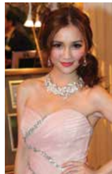
— KAY TSE CHINESE PLATINUM POP STAR; VEGETARIAN

“I just feel that although she is not here with all of us, we feel that her spirit and her love are with all of the audience and production. All of us feel her love and her support. Happy Supreme Master Ching Hai Day!”