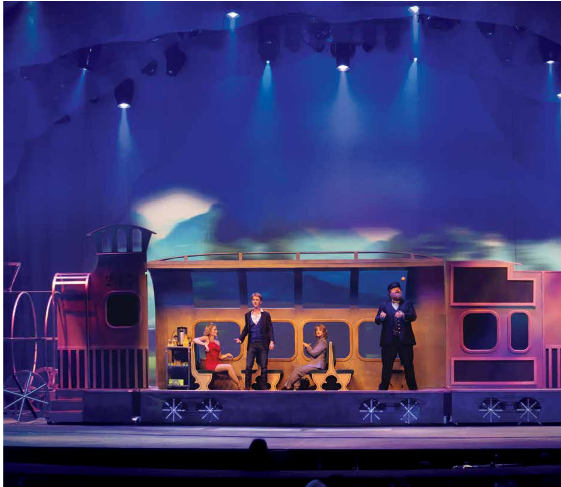
ON BOARD THE MAGICAL TRAIN.