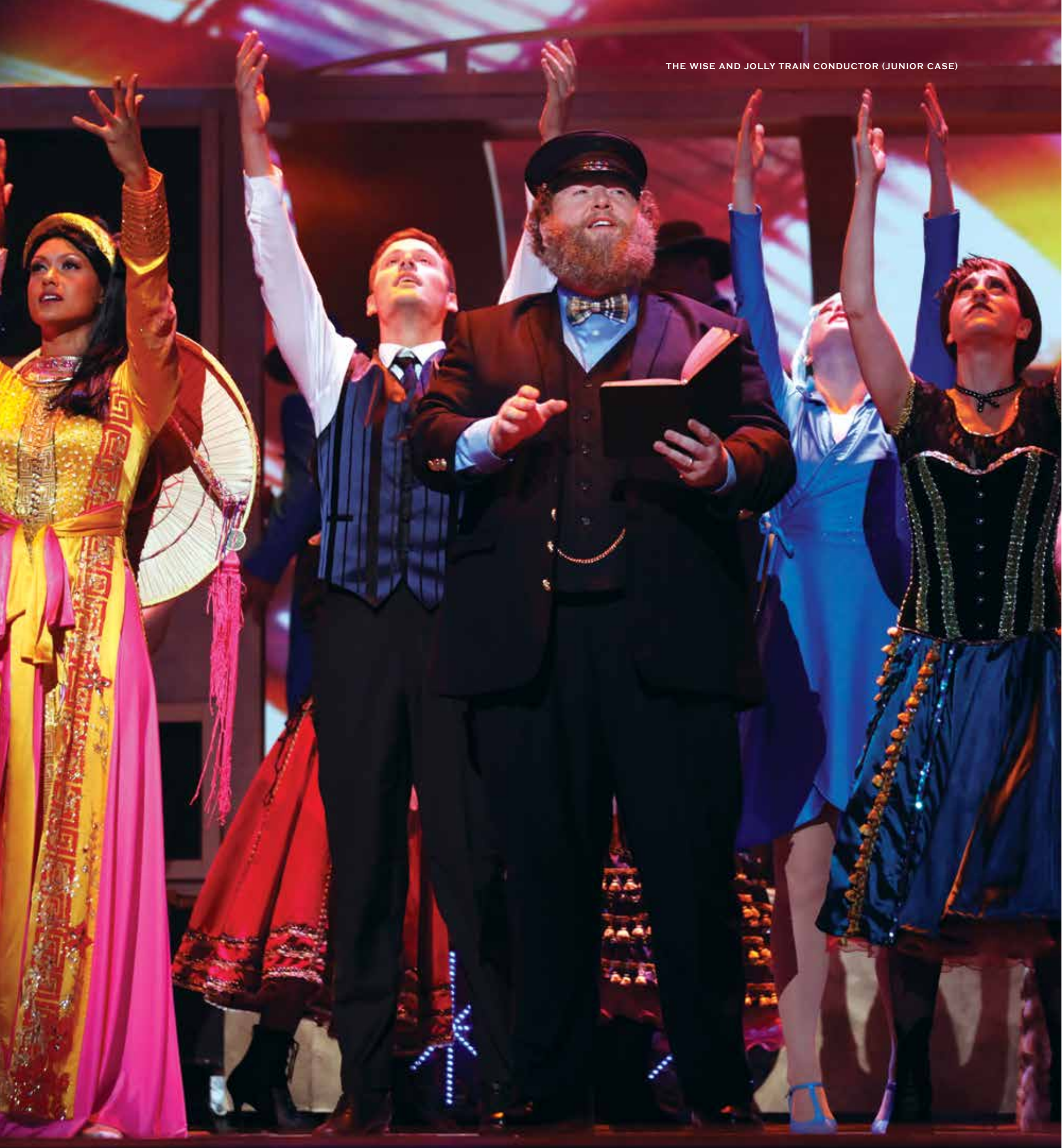
THE WISE AND JOLLY TRAIN CONDUCTOR (JUNIOR CASE)

(CONDUCTOR opens the book... As he reads aloud, he is backed by the TRAVELERS in a choral chant.)