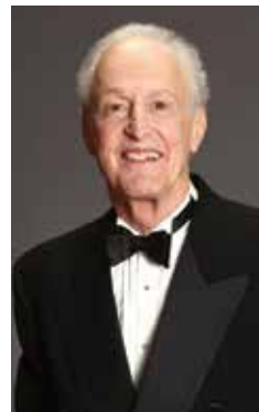
— DAVID SHIRE ACADEMY AND 2-TIME GRAMMY AWARD-WINNING COMPOSER ( SATURDAY NIGHT FEVER )

“Supreme Master Ching Hai, it was such an honor and pleasure as always to set your special poems to music. I was proud to be part of the gifts of happiness that spring from your wonderful heart into the hearts of others. My warmest wishes to you on Supreme Master Ching Hai Day!”