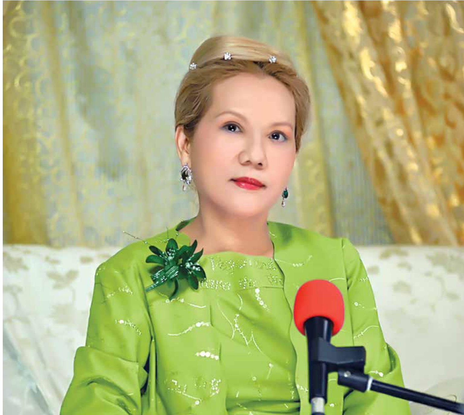
AUGUST 8, 2009 - EUROPE

B orn in central Âu Lạc* (Vietnam), Supreme Master Ching Hai studied in Europe and worked there for the Red Cross. From childhood, she realized that suffering exists in all parts of the globe, and a deep longing for a remedy eventually led her to seek spiritual understanding.