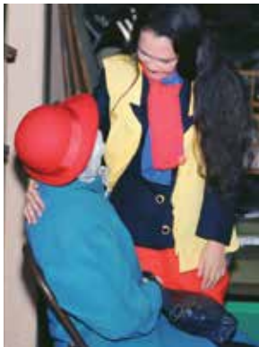
FROM LEFT TO RIGHT RESCUING ABANDONED DOGS – HUNGARY (MAR. 1, 2005) VISITING AN ORPHANAGE – ABIDJAN, CÔTE D'IVOIRE (AUG. 1995) GIVING PRESENTS TO DISADVANTAGED CHILDREN – MEXICO (DEC. 9, 2010) COMFORTING FLOOD VICTIMS – CALIFORNIA, USA (JAN. 1997)