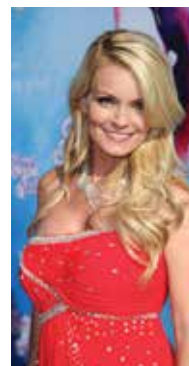
— KELLY PACKARD ACTRESS ( BAYWATCH ); VEGETARIAN

“Peace and love, she [Supreme Master Ching Hai] just emulates that. And everything that she writes emulates that.”