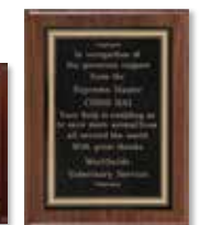
APPRECIATION PLAQUES DEDICATED TO SUPREME MASTER CHING HAI FROM THE RECIPIENT CHARITIES.