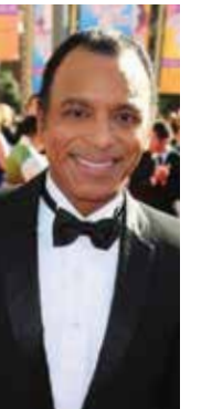
— JON SECADA 2-TIME GRAMMY AWARD-WINNING POP STAR

“Supreme Master Ching Hai, this is Jon Secada, and I’m very honored and I feel very blessed to be a part of Loving the Silent Tears . It’s going to be a wonderful show, and I’m humbled to have been able to put music to your words in your poem. So, thank you, and I hope you enjoy it. Felicidades [congratulations] for a tremendous 19 years. And I’m sure you’ll have an eternity of more, many, many more years. Congratulations!”